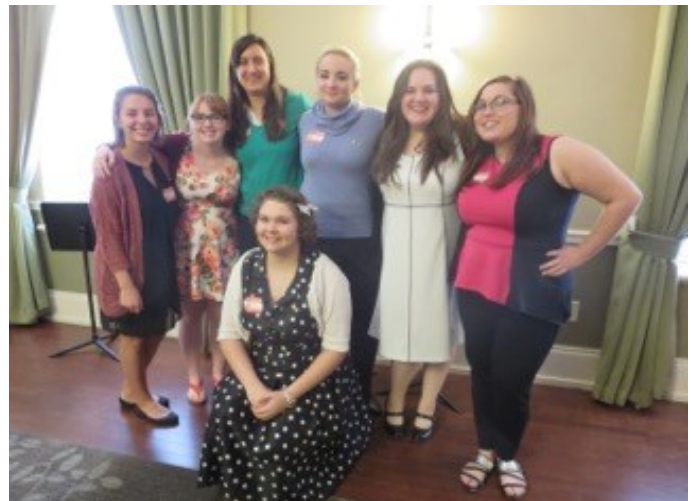
Sigma Gamma members at Zeta A Province Day.