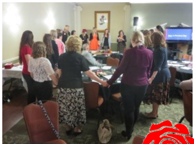
Iota Alpha 75 year rededication ceremony.