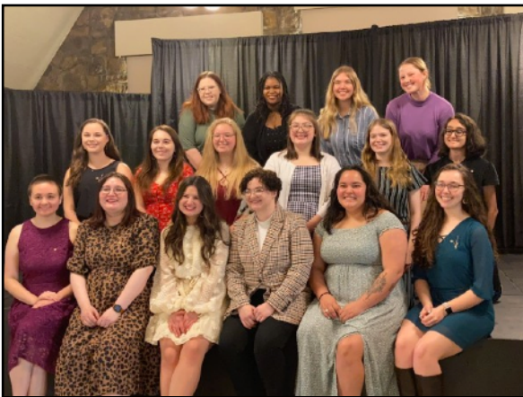
Sigma Gamma Chapter at Senior Farewell.