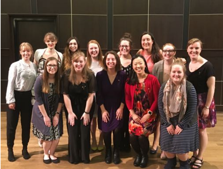
Sigma Gamma Seniors at Initiation