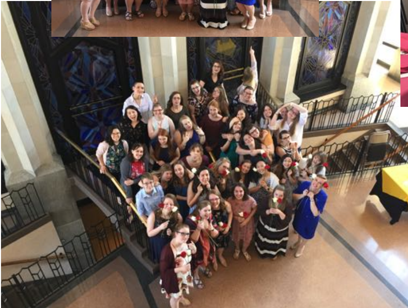
Sigma Gamma Chapter at Senior Luncheon