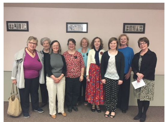
Tulsa Alumnae at Senior Luncheon