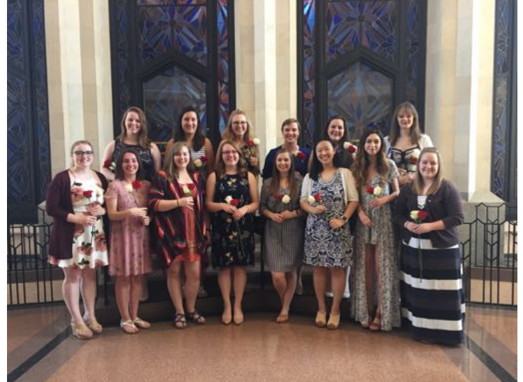
Sigma Gamma Seniors at Senior Luncheon